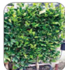
Espalier - Citrus