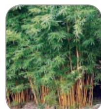
Bambusa multiplex var. alphonse-karr