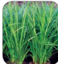
Liriope 'Evergreen Giant'