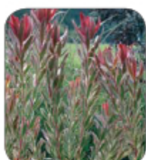
Leucadendron 'Safari Sunset'