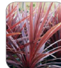
Cordyline 'Red Sensation'