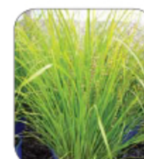
Lomandra longifolia 'Tanika'