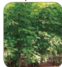
Bambusa textilis Gracilis