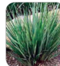
Dianella 'Little Rev'