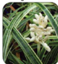
Liriope 'Stripey White'