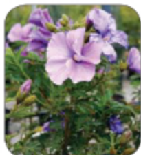
Alyogyne huegelii 'West Coast Gem'